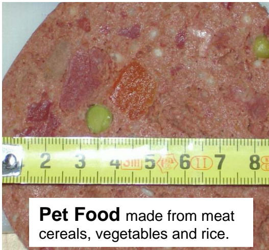
Pet Food made from meat cereals, vegetables and rice.

Wide formulation ability: from low to high viscosity, low to high moisture, with particulates or homogeneous.