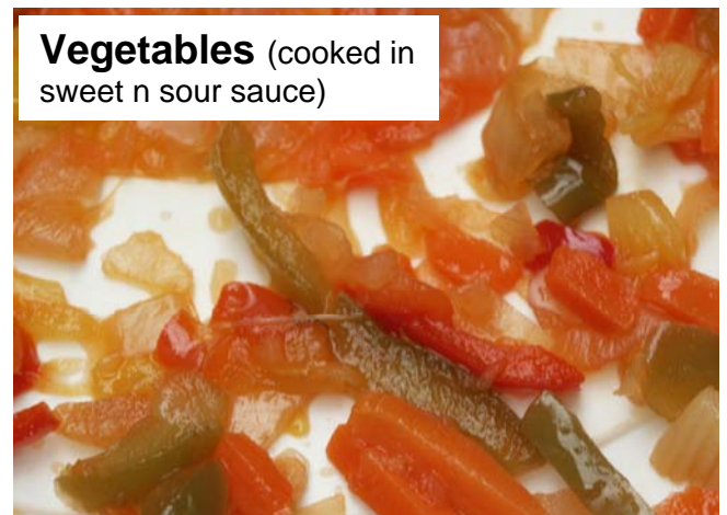
Vegetables (cooked in sweet n sour sauce)